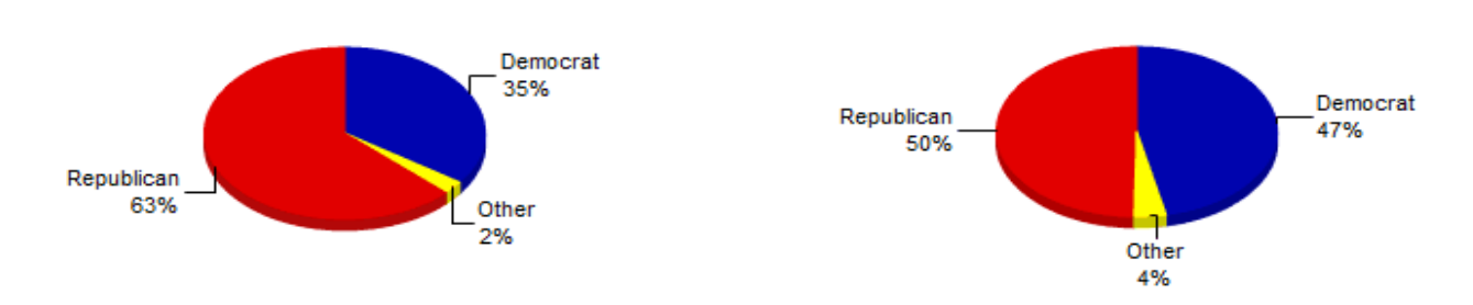
Chart 1. AVMA PAC Contributions by Party, (1/1/2021-12/31/2022)

AVMA PAC is nonpartisan. The AVMA PAC Board strives to keep an even distribution of PAC funds to each political party. The "other" category in Chart 1 should be counted as Democrats since the Minnesota Democrat Farm Labor party uses an alternate name. This chart is for the 2021-22 Election cycle, and contributions are issued in the order in which AVMA staff or Ambassador attend fundraising events.